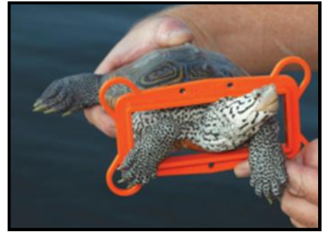
An excluder device fits into the entrance funnel on crab pots to reduce diamond-backed terrapin bycatch (MD DNR)