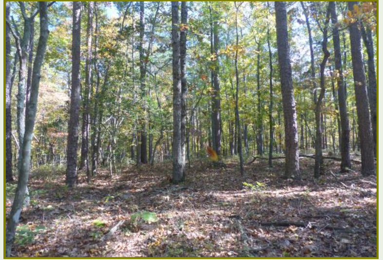
Coastal Plain Oak-Pine Forest

The key wildlife habitats of Maryland represent a diverse portfolio of ecological systems, each bound by a similar physiography, geology, hydrology, climate, soil composition, flora, or other significant characteristics. Maryland’s SWAP