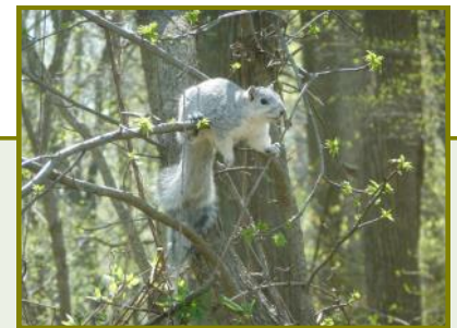
Delmarva fox squirrel

Maryland's SWAP describes the process used to select Maryland's Species of Greatest Conservation Need (SGCN) and summarizes the best available information regarding the conservation status, distribution, and abundance of all major animal groups that occur in Maryland. Plant SGCN (750 species) are also included. The SGCN reevaluation and selection process involved the input of numerous species experts and the consideration of many priority lists and ranking systems. Maryland's 610 SGCN wildlife are representative of many animal groups, including mammals, birds, reptiles, amphibians, fishes, insects, freshwater mussels, and other invertebrates. This includes all state- and federally listed Threatened or Endangered species, rare species, endemic species, declining species, and responsibility species for which Maryland harbors a significant portion of the overall population. In addition to discussing Maryland's carefully selected SGCN, the SWAP expands upon Extinct and Extirpated species of Maryland, wildlife species in a regional context, and species' conservation statuses. The appendices that accompany SWAP include listings of all Species of Greatest Conservation Need with rankings from various organizations and other wildlife conservation plans.