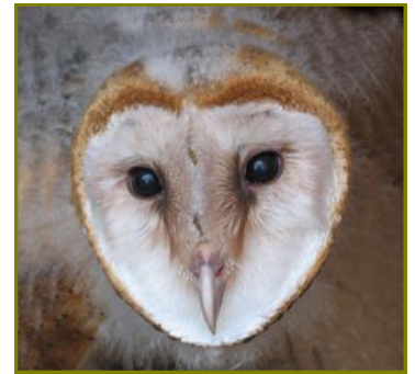
Left to right: northern red salamander, maritime forest and shrubland habitat, MD DNR biologist in the field, barn owl