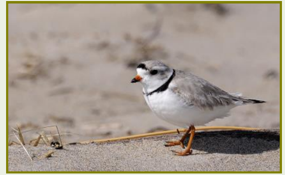
Piping plover

More than 15,000 animal and plant species call Maryland home. Nearly 1,200 of these species are rare, uncommon, or declining. Maryland's wildlife distribution and abundance ultimately depend on the ecological diversity of the state's habitats. The varied physiographic features, geology and resulting soil types, topography, and climate of Maryland support a range of plant communities and aquatic environments that provide various habitats for wildlife. Maryland's landscape, wetlands, and waterscape, including the Chesapeake Bay and Atlantic Ocean, support some of the country's most imperiled and endangered species, such as the dwarf wedgemussel, piping plover, and bog turtle. A few animals in Maryland are found nowhere else in the world.