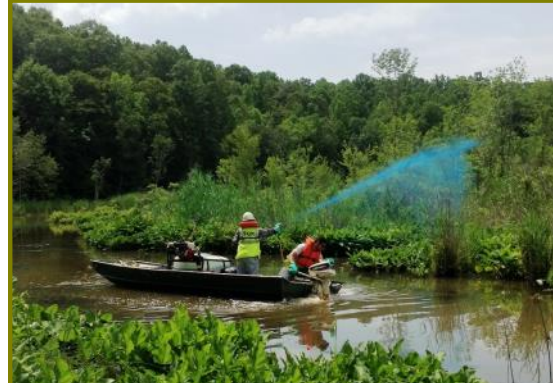
Left, little brown bat exhibiting white-nose fungus ; Right, MD DNR biologists spraying herbicide on invasive Phragmites australis