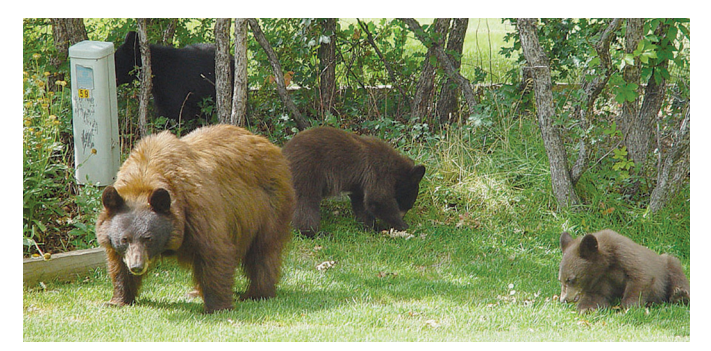
Don't force a mother black bear to defend her cubs.

If you live in or travel to bear country and own a dog, sooner or later your dog may encounter a bear. Understanding why some encounters end peacefully and others end with dogs and people being injured or killed can help keep people, dogs and bears safe.