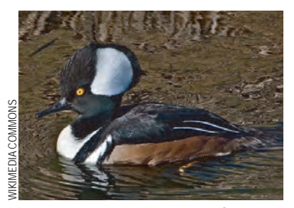
Andover Flatwoods is a refuge for migratory waterfowl like this beautiful male hooded merganser.