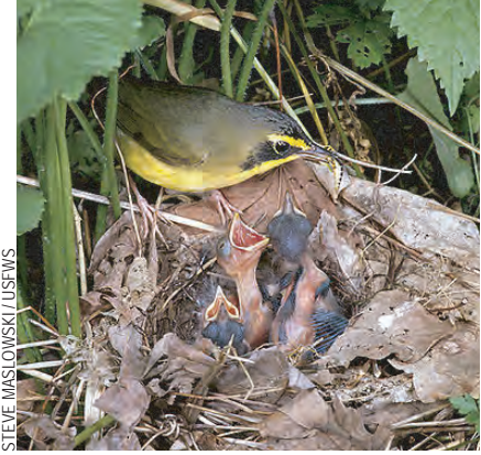
Kentucky warblers nest among dense vegetation on the ground.

The diversity and size of habitats within Parkers Creek make it a haven for nesting birds, particularly Forest Interior Dwelling Species (FIDS). The National Audubon Society recently designated Parkers Creek as an Important Bird Area due to the 19 species of FIDS found regularly breeding there. Of particular interest are the wood thrush and Kentucky warbler. These migratory songbirds have significant breeding populations here but are in decline throughout much of their breeding range in the U.S. Increased forest fragmentation has made their nests more vulnerable to parasitism by female brown-headed cowbirds. These unusual birds lay their eggs in other birds' nests. For smaller songbirds, such as warblers and wrens, the adult ends up eventually feeding a chick that is nearly twice its size, while its own chicks starve!