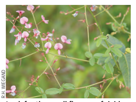
Look for the small flowers of rigid tick-trefoils in mid-summer. These rare plants produce a natural insect repellant as well as compounds known to kill certain species of weed.