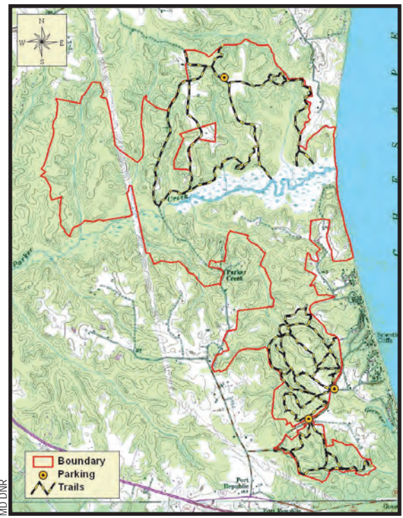
Parkers Creek Natural Area